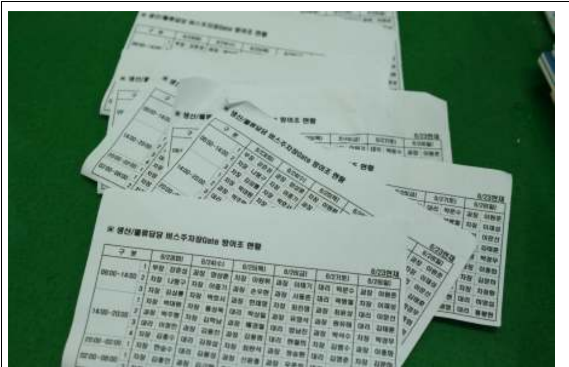
Materials taken from a company manager in the course of 26 – 27 June : Sheets distributed by the company outlining assignment of goons to different pro-company rallies and pro-company activities